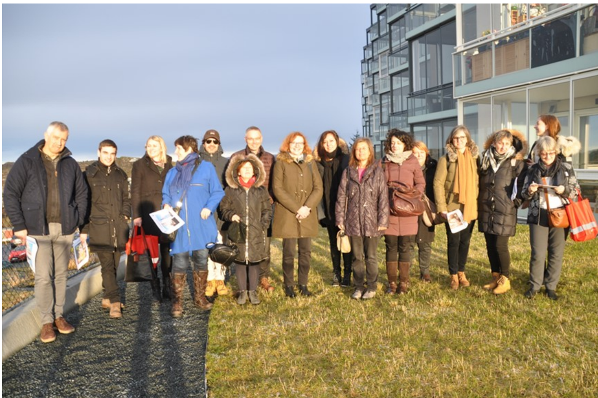
Participant at Straume Regional Centre, Municipality of Fjell