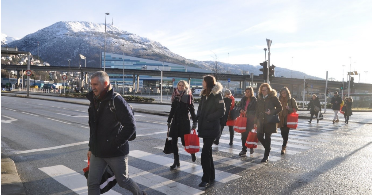
Walking to the bus, Mt. Ulriken, Bergen in the background