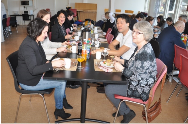
Lunch, and presentation of the kitchen staff; students with special needs