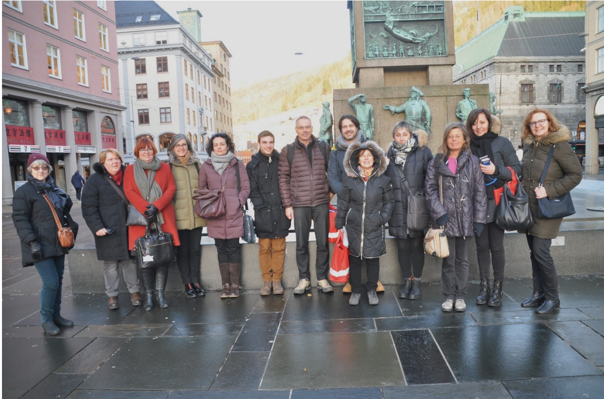
At Torgallmenningen – City center Bergen