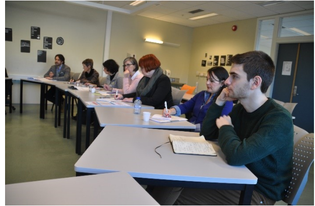
Questions, comments, exchange of ideas