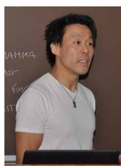
A school auditorium