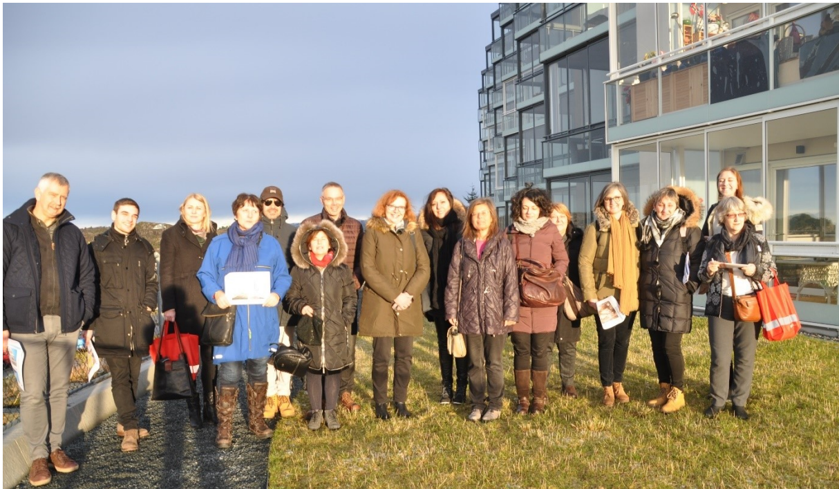
The participants at a new housing area at Straume Regional Centre