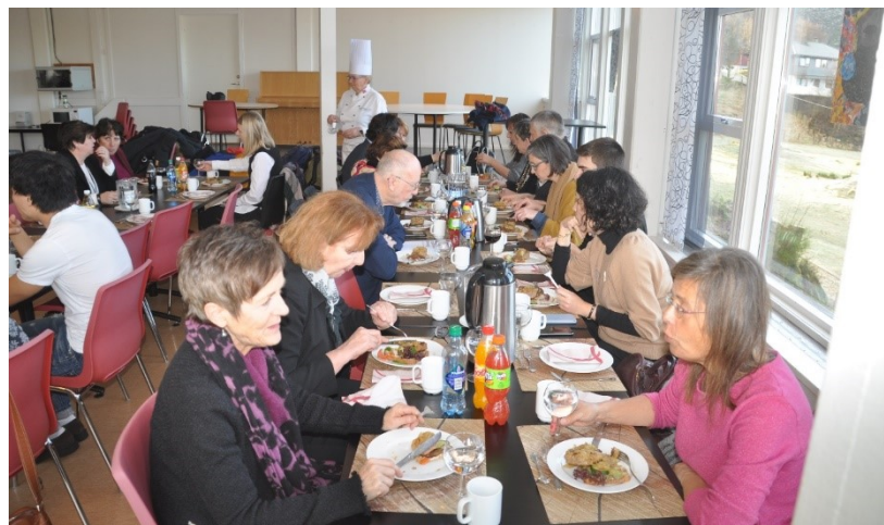
Lunch at Sotra upper secondary school